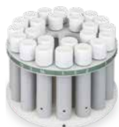
fastEX-24 Extraction rotor for environmental sample