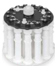
MMR-15 Evaporation/ Concentration rotor