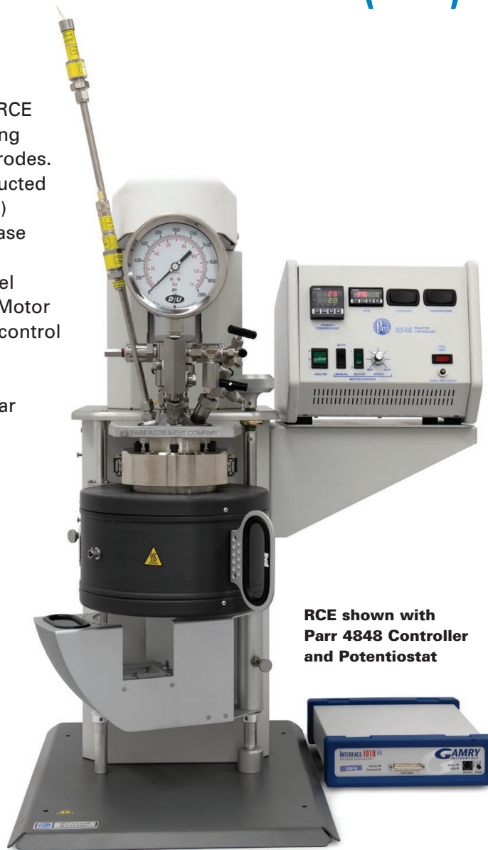
RCE shown with Parr 4848 Controller and Potentiostat

Many other features and specifications are also customizable. Contact us today to discuss your research needs.